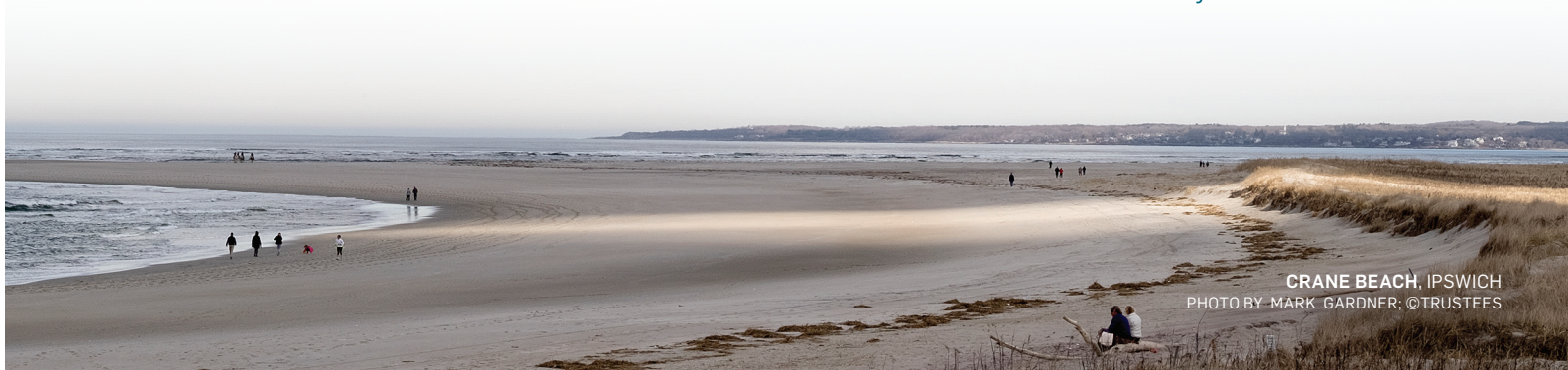
CRANE BEACH, IPSWICH

For questions or assistance with processing your gift, email development@thetrustees.org or call 978-870-1299 . The Trustees EIN Tax ID is 04-2105780 . Gifts to the annual fund are fully tax-deductible.