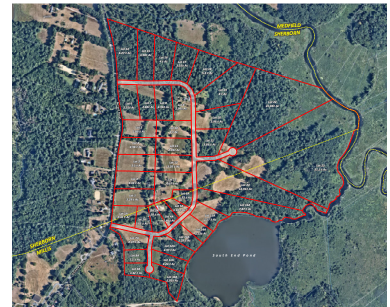
A map showing the potential for a maximum 40-lot development if a conservation outcome is not achieved for Millborn Farm.

*Includes parking area, trails, signage, stabilizing buildings, creating water access, ecological and cultural resources research, and other activities to create a safe and welcoming Trustees reservation.