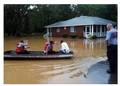
Flooding in Charlotte, NC after heavy rain in 2011.

"Since 1999, Storm Water Services has purchased over 400 flood-prone houses, apartment buildings and businesses that were in floodplains throughout Charlotte-Mecklenburg. Over 700 families and businesses have moved to less vulnerable locations