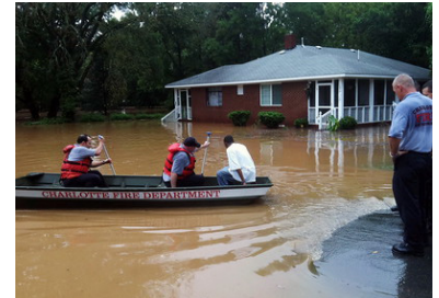
Flooding in Charlotte, NC after heavy rain in 2011.

“Since 1999, Storm Water Services has purchased over 400 flood-prone houses, apartment buildings and businesses that were in floodplains throughout Charlotte-Mecklenburg. Over 700 families and businesses have moved to less vulnerable locations