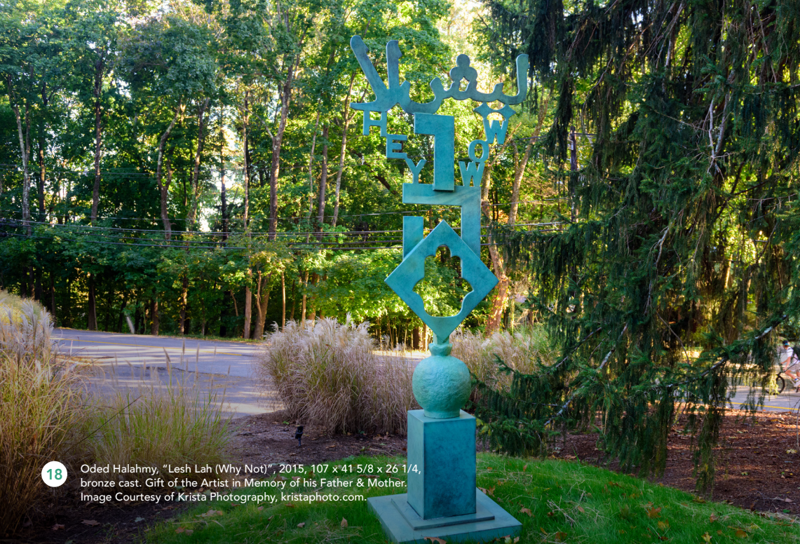
18 Oded Halahmy, "Lesh Lah (Why Not)", 2015, 107 x 41 5/8 x 26 1/4, bronze cast. Gift of the Artist in Memory of his Father & Mother.