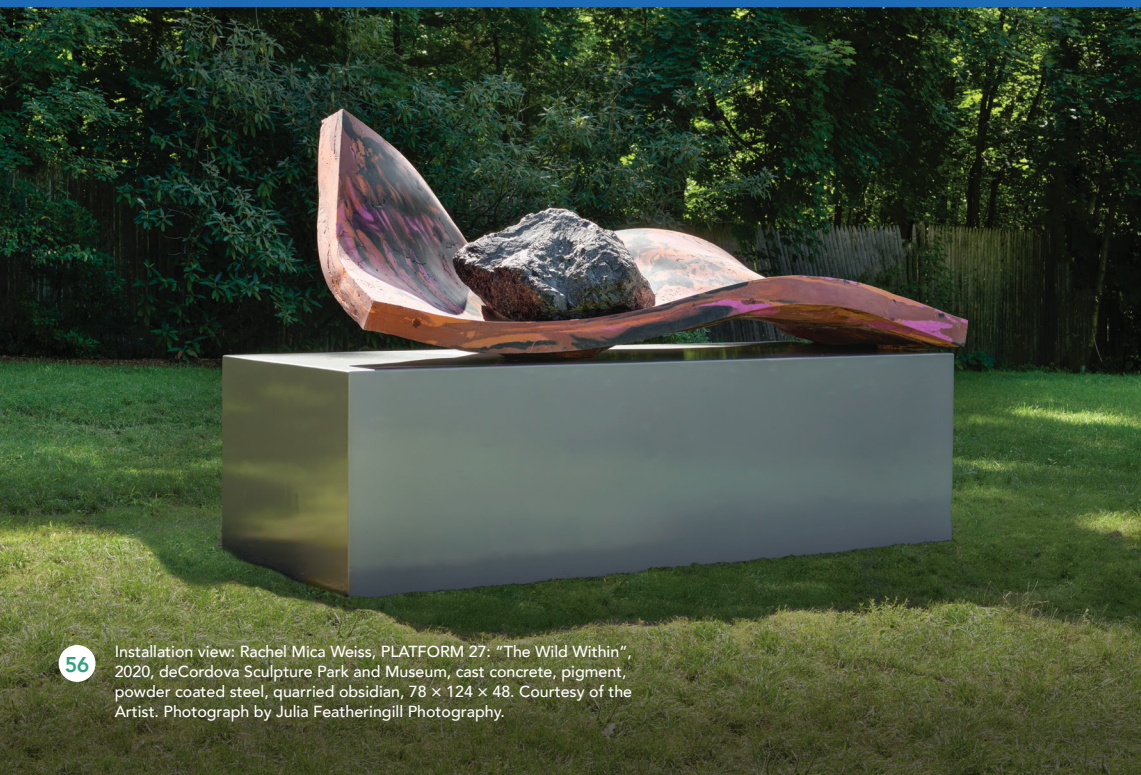
56 Installation view: Rachel Mica Weiss, PLATFORM 27: "The Wild Within", 2020, deCordova Sculpture Park and Museum, cast concrete, pigment, powder coated steel, quarried obsidian, 78 x 124 x 48.