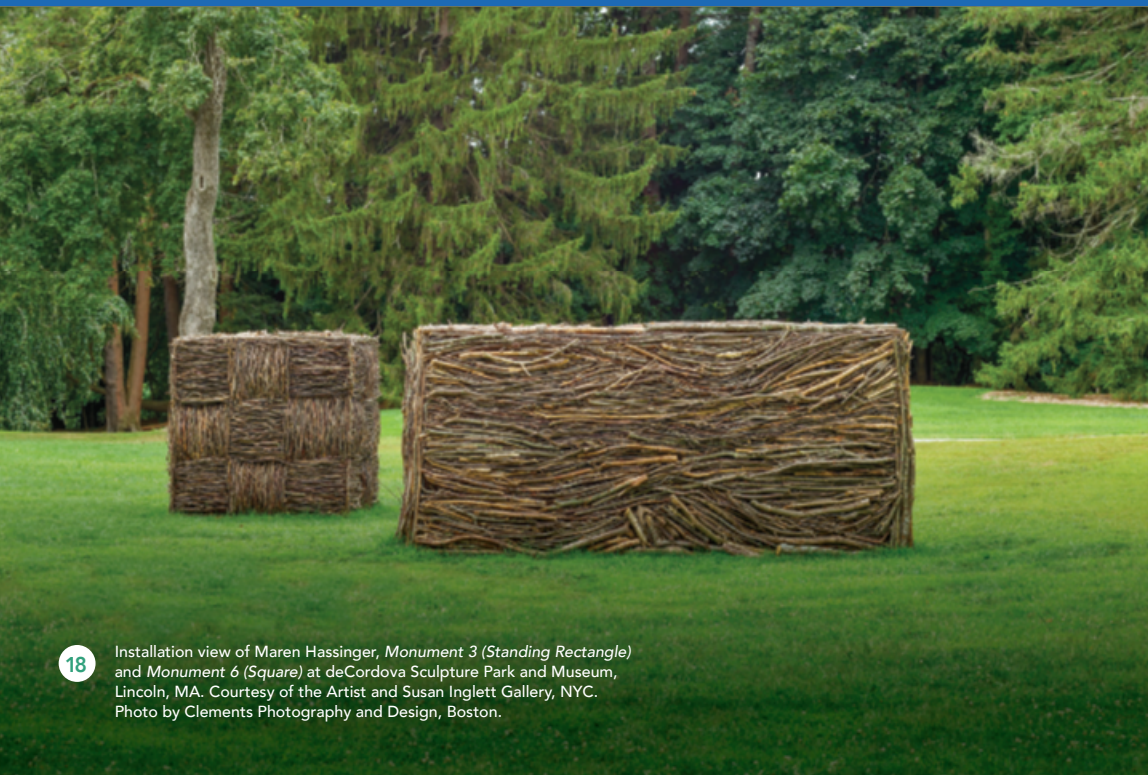
18 Installation view of Maren Hassinger, Monument 3 (Standing Rectangle) and Monument 6 (Square) at deCordova Sculpture Park and Museum, Lincoln, MA.