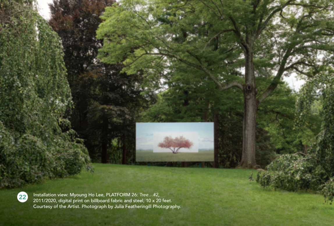
22 Installation view: Myoung Ho Lee, PLATFORM 26: Tree...#2, 2011/2020, digital print on billboard fabric and steel, 10 x 20 feet.